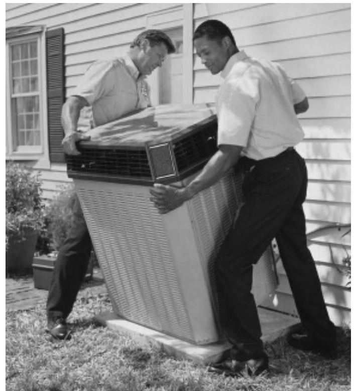
An efficient AC upgrade can make a significant increase in energy savings, such as a SEER 14, or greater, condenser unit.

The incentives apply to homes “substantially completed” after August 8th, 2005 and “acquired from the eligible contractor after December 31, 2005 and before January 1, 2008, for use as a residence.” Proposed extenders may carry the tax credits through calendar year 2009.